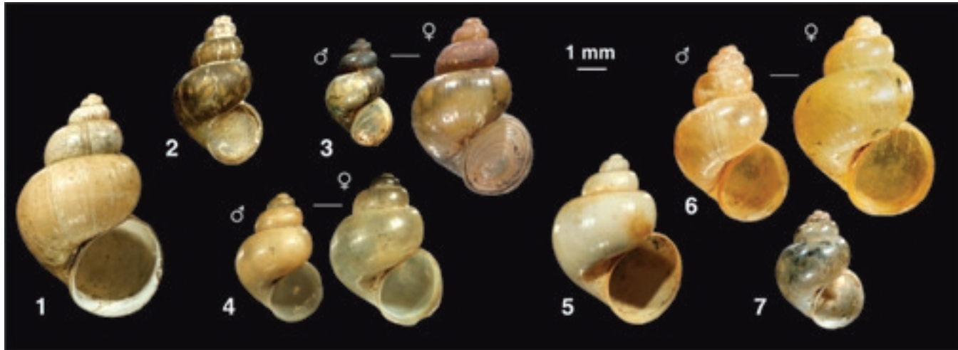
Figure 7 The Bithynia spp. of Greece. – 1: Bithynia graeca , 2: B. prespensis , 3: B. kastorias , 4: B. hellenica , 5: B. renei , 6: B. cretensis , 7: B. candiota .