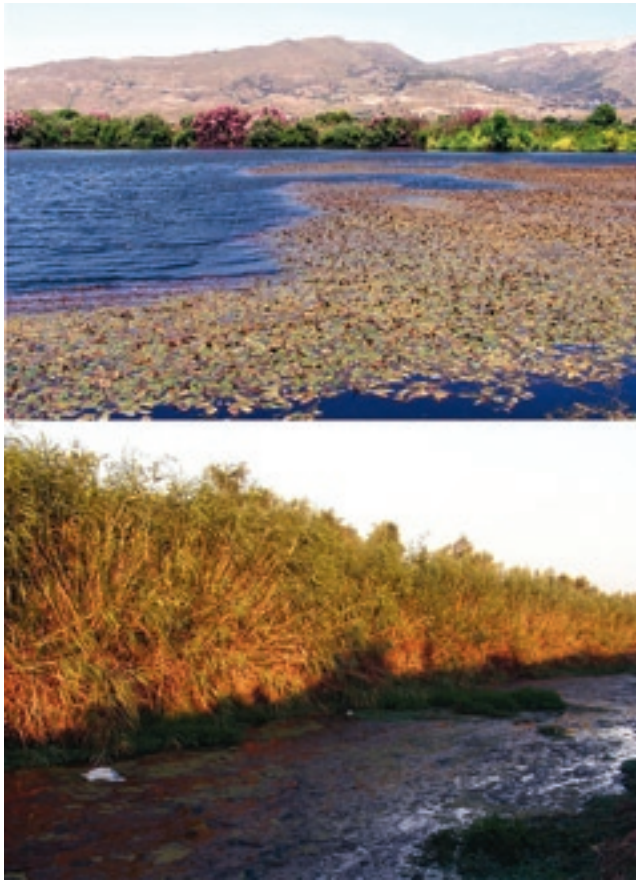
Figure 4 Sampling sites of the new Pseudobithynia zogari . top: Island Evia, bottom: Skala town, canal (type locality).

from this species by the operculum, which is in P. euboensis not cochleate and the penis of the latter species is broader with a small penis tip.