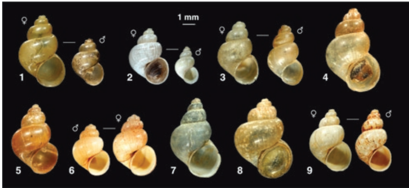
Figure 8 The Pseudobithynia spp. of Greece. – 1: Pseudobithynia panetolis , 2: P. falniowskii , 3: P. trichonis , 4: P. gittenbergeri , 5: P. zogari , 6: P. euboensis , 7: P. westerlundi , 8: P. hemmeni , 9: P. ambrakis .