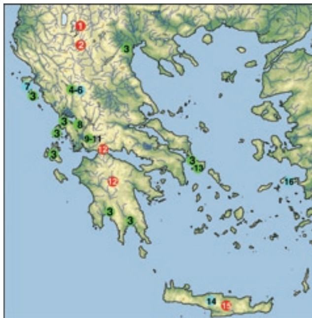
Figure 6 The distribution of the Bithyniidae in Greece. The genus are marked by coloured dots: red = Bithynia , green = Pseudobithynia , cyan = unknown genus. 1: Lake Prespa, B. prespensis , 2: Lake Kastorias, B. kastorias , 3: Lowlands of Greece, P. zogari , 4–6: Lake Pamvotis (Lake Ioannina, 4: P. westerlundii , 5: Bithynia graeca ; 6: P. hemmeni , 7: Corfu, P. renei , 8: Lake Ambrakia, P. ambrakis , 9–11: Lake Trichonis: 9: P. trichonis , 10: P. panetolis , 11: P. falniowskii , 12: B. hellenica , 13: P. euboensis , 14: Crete, Bithynia candiota . 15: Crete, B. cretensis , 16: Samos: P. gittenbergeri .

At the beginning of the research into the Bithyniidae of Greece only two Bithynia spp. were known from this region, now about 16 species are recognised which belong to two genus groups. In summary we can say that the distribution pattern of the Bithyniidae in Greece is not stochastic through passive dispersal, the main process that disperses freshwater mollusks into new lentic habitats outside drainage systems, is random. Despite this latter fact, the effective immigration rate resulted in a zoogeographical distribution pattern. We can split the Bithyniidae in Greece into three groups: (i) those that live endemically in ancient lakes, (ii) those that live endemically on islands, and (iii) those that are widely distributed in the lowlands of Greece (Fig. 6). The latter group seems to consist of only one Bithynia sp. and two Pseudobithynia spp. All the other fourteen