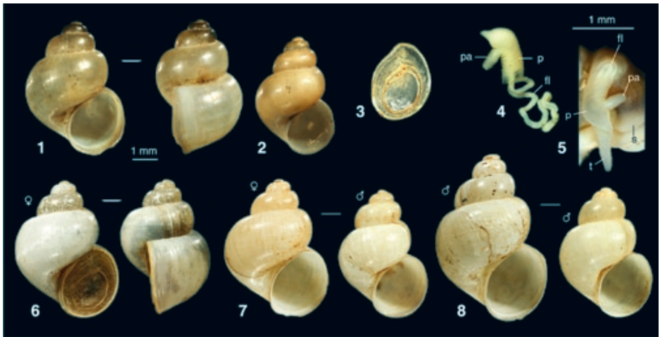
Figure 2 Bithynia hellenica . 1–2: Syntypes, 1: this specimen was already depicted by Kobelt (1891, pl. 137, fig. 860), 3–9: B. hellenica from Lake Taka. – fl = flagellum, p = penis, pa = penial appendix, s = snout, t = tentacle.

Material examined Greece, Lake Ambrakia, 1985, leg. A. Falniowski