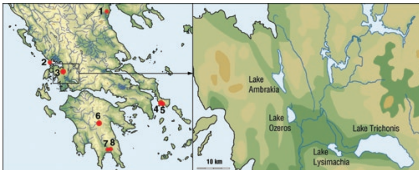
Figure 1 The sampling sites. 1: Lithoro ( Pseudobithynia zogari n. sp.), 2: Preveza ( P. zogari ), 3: Lake Ambrakia ( P. ambrakis ), 4: Euboea, ( P. euboensis ), 5: Euboea, ( P. zogari ), 6: Taka Lake ( Bithynia hellenica ), 7: Skala town, canal ( P. zogari ), 8: Evrotas river near Skala town city ( P. zogari ).

In his original description, Kobelt (1892: 67) mentioned that the surface of the shell was latticely sculptured, and he used this feature as a means of distinguishing B. hellenica from B. orsinii . However, in none of the 8 syntypes that we were able to study could we find this feature. Concerning the distribution, he mentioned that this species populated Greece and the islands of the archipelago.