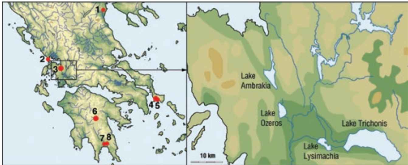
Figure 1 The sampling sites. 1: Lithoro ( Pseudobithynia zogari n. sp.), 2: Preveza ( P. zogari ), 3: Lake Ambrakia ( P. ambrakia ), 4: Euboea, ( P. euboensis ), 5: Euboea, ( P. zogari ), 6: Taka Lake ( Bithynia hellenica ), 7: Skala town, canal ( P. zogari ), 8: Evrotas river near Skala town city ( P. zogari ).

In his original description, Kobelt (1892: 67) mentioned that the surface of the shell was latticely sculptured, and he used this feature as a means of distinguishing B. hellenica from B. orsinii . However, in none of the 8 syntypes that we were able to study could we find this feature. Concerning the distribution, he mentioned that this species populated Greece and the islands of the archipelago.