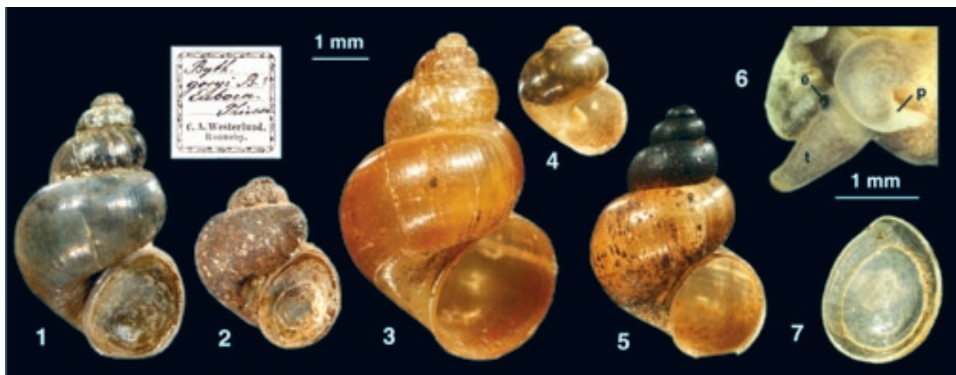
Figure 5 Pseudobithynia zogari n. sp. – 1–2: “ Bithynia goryi B.?” from Westerlund's collection = P. zogari n. sp., 3–7: P. zogari n. sp. – e = eye, p = penis, t = tentacle.

Description Shell glossy and reddish horn-coloured, surface finely striated, 5–5.5 whorls