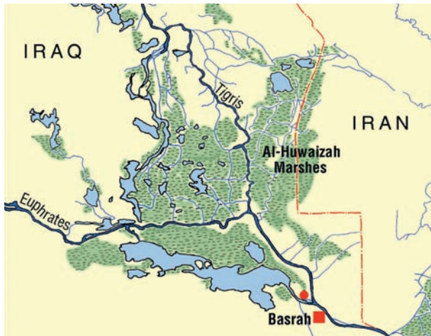
Fig. 1. The sampling site of Bithynia hareerensis n. sp.: Hareer station (part of Garmat Ali river, red point) at 30° 35' 24" N, 47° 43' 21" E.