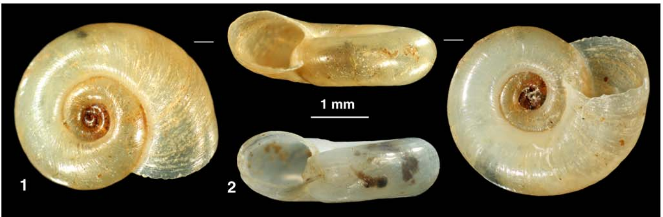
Fig. 6 Gyraulus laevis and Planorbis sp. from Sicily. 1 Planorbis sp., 2 Gyraulus laevis . (Hamburg, Germany)