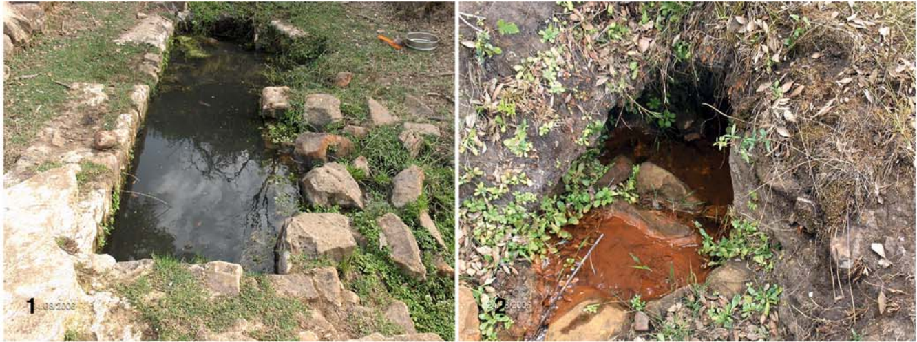
Fig. 1 The habitats of the sampling sites. 1 Ain Damous 2 Ain Feïd-El-Bagrat.

as well as the anatomy which is distinct from the drawing of Giusti (1968) as well as Giusti et al. (1995) because the phallotheca is shorter. Thus the identity of Planorbis agraulus is uncertain.