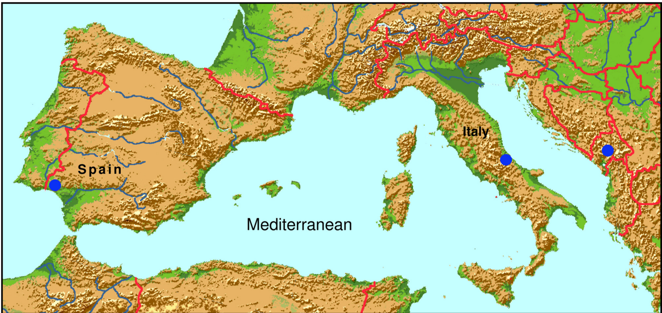
Figure 1. Known distribution of Arganiella (blue dots).