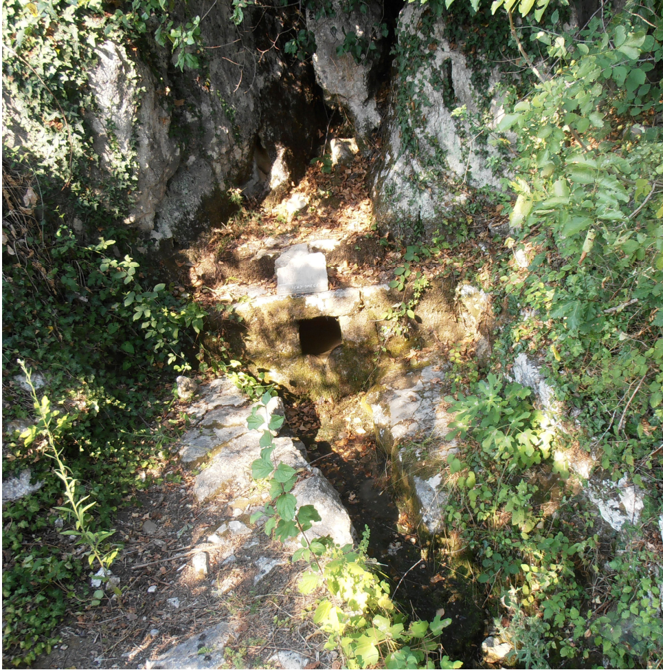
Figure 4. Type locality of Arganiella tabanensis n. sp.

Differentiating characters. Arganiella pescei Giusti & Pezzoli, 1980 differs by a gill with 17-18 instead of 11 lamellae, further, a coiled instead of U-like bend intestine on the pallial wall and, finally, a greater difference in size of bursa and receptaculum, that is a larger bursa and a smaller receptaculum compared to the new species. The far remote Arganiella wolfi (Boeters & Glöer, 2007) can be differentiated by a penis with a black pigmented core and an oblong and not globular bursa.