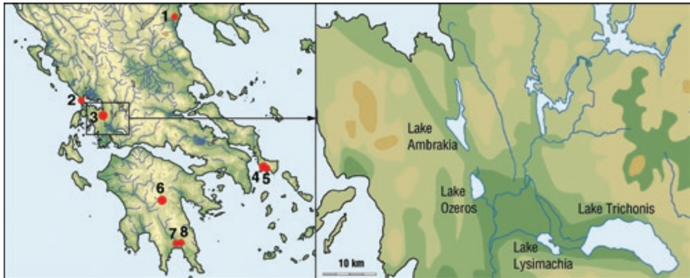
Figure 1 The sampling sites. 1: Litohoro ( Pseudobithynia zogari n. sp.), 2: Preveza ( P. zogari ), 3: Lake Ambrakia ( P. ambrakia ), 4: Euboea, ( P. euboensis ), 5: Euboea, ( P. zogari ), 6: Taka Lake ( Bithynia hellenica ), 7: Skala town, canal ( P. zogari ), 8: Evrotas river near Skala town city ( P. zogari ).

In his original description, Kobelt (1892: 67) mentioned that the surface of the shell was latticely sculptured, and he used this feature as a means of distinguishing B. hellenica from B. orsinii . However, in none of the 8 syntypes that we were able to study could we find this feature. Concerning the distribution, he mentioned that this species populated Greece and the islands of the archipelago.