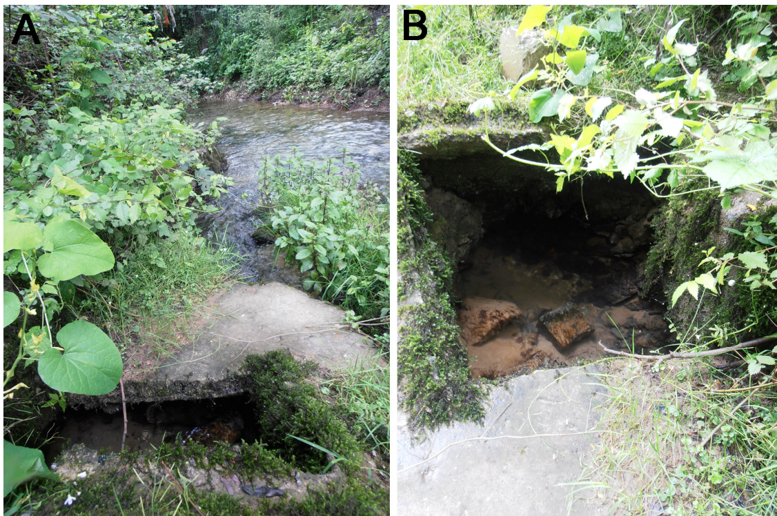
Figure 1. Sampling site: spring in the Pričelje village near Podgorica: A = spring with spring outlet. B = spring source.

The living specimens were fixed in 95% ethanol. The animals were analyzed both morphometrically and anatomically. Images of the shell, soft body and genitalia were photographed with a Leica digital camera system. The studied material is stored in the Zoological Museum of Hamburg (ZMH).